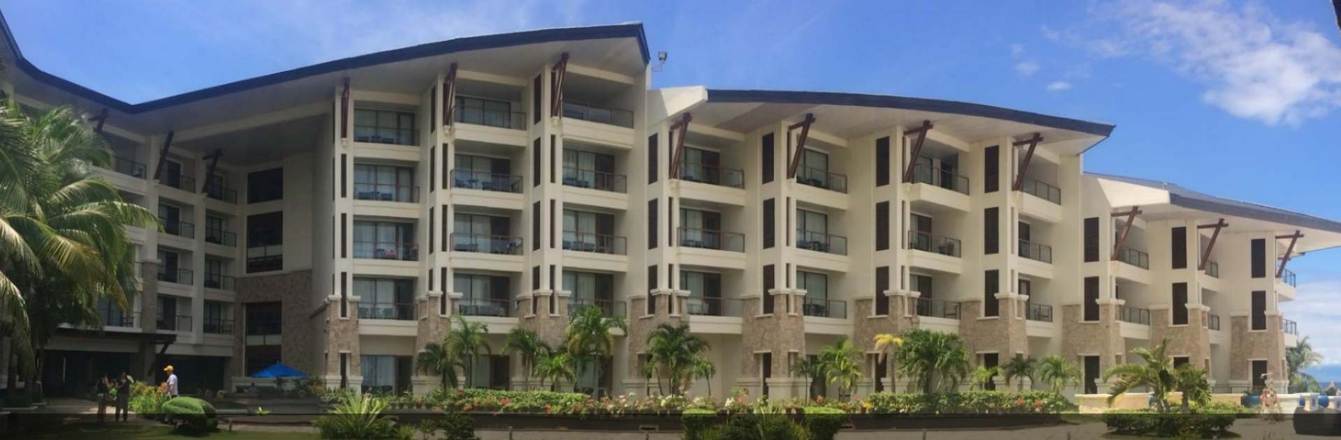
VENUE: Bellevue Hotel, Panglao Island, Bohol, Philippines